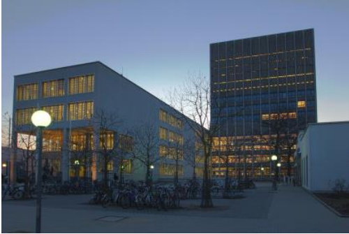
(c) Subfloat. Image No. 3. Note: If there are only two lines, the caption will not be justified as ragged right when using a manual line break.