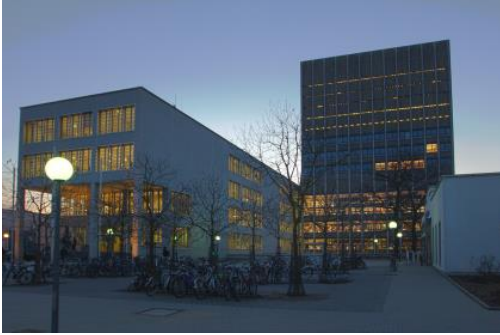
(a) Subfloat. Image No. 1. One-line captions are centered.

justo. In ac felis quis tortor malesuada pretium. Pellentesque auctor neque nec urna. Proin sapien ipsum, porta a, auctor quis, euismod ut, mi.