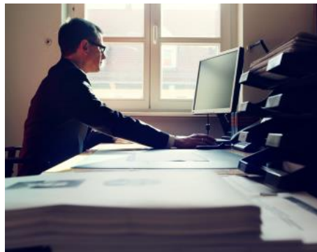
Figure 3.3: Scientist in his workplace. Please always set images manually with the parameter [h]. At this point the image has been placed with the Figure parameter [h]. There is an empty line before and after the figure environment.

Phasellus magna. Phasellus a est. Phasellus magna. In hac habitasse platea dictumst. Curabitur at lacus ac velit ornare lobortis. Aenean viverra rhoncus pede. Pellentesque habitant morbi tristique senectus et netus et malesuada fames ac turpis egestas. Ut non enim eleifend felis pretium feugiat vivamus quis mi. Phasellus a est. Phasellus magna et netus et malesuada fames ac turpis egestas.