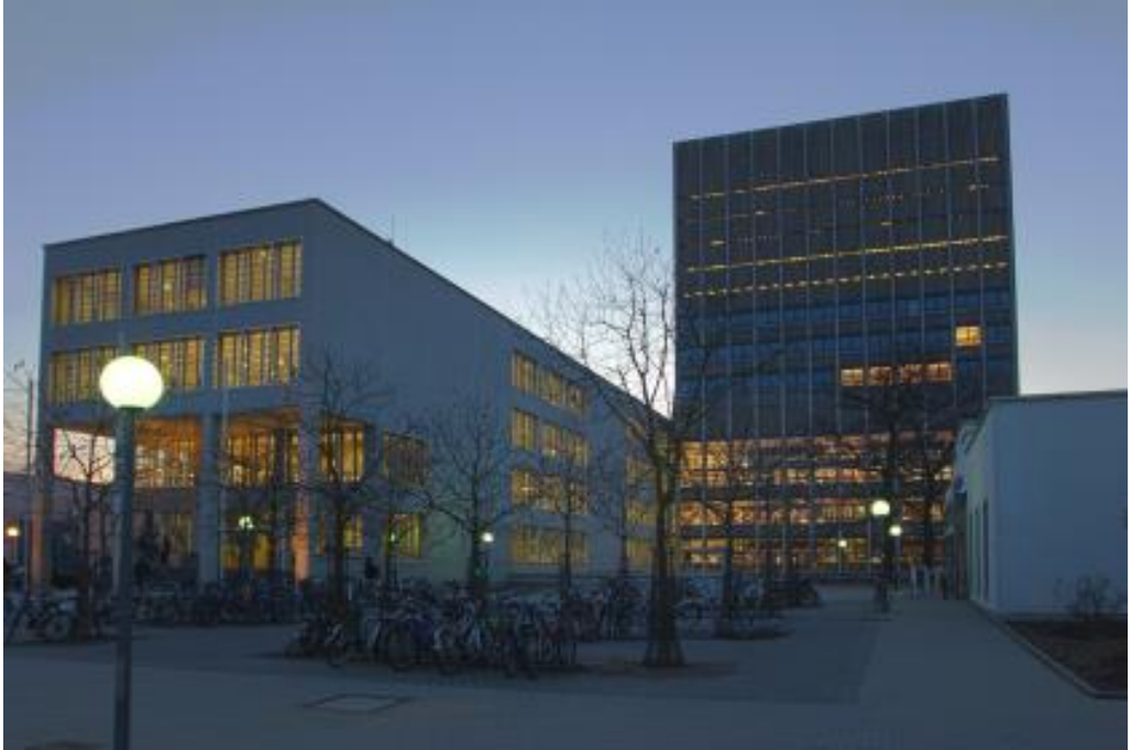
Figure 3.1: Exterior view of the KIT library. Please always set images manually with the parameter [h]. At this point the image has been placed with the Figure parameter [h]. There is an empty line before and after the Figure environment.

dolores et ea rebum. Stet clita kasd gubergren, no sea takimata sanctus est Lorem ipsum dolor sit amet. Stet clita kasd gubergren, no sea takimata sanctus est Lorem ipsum dolor sit amet.